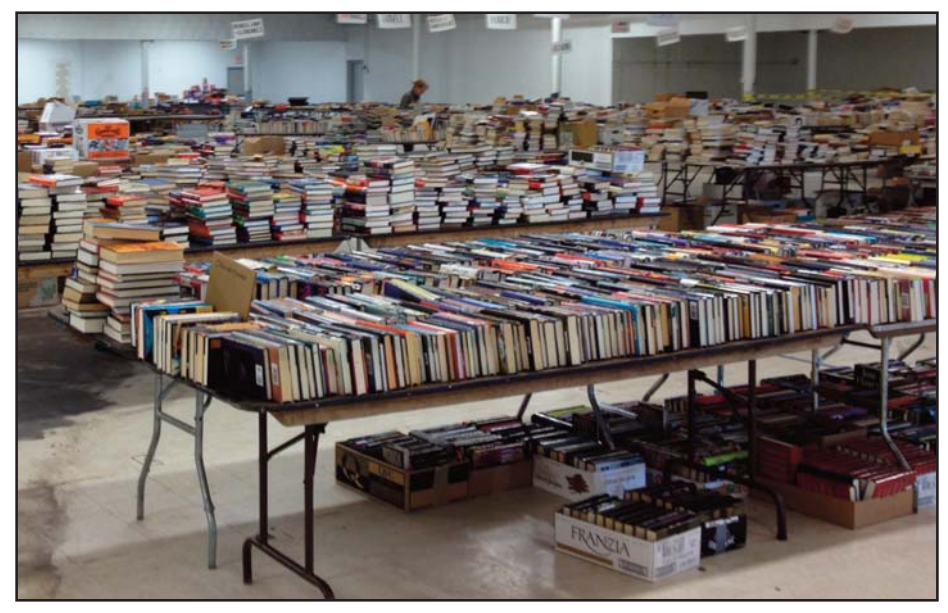
Proceeds from Buffalo's book sale, which began in 1955, have grown to over $50,000.

See the convention packet for details on each event. Fundraising is a big part of our mission in changing the lives of women and girls.